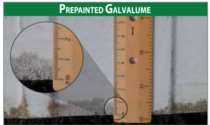
Comparison of drip edge corrosion on a 20 year old building in severe acid rain environment, Pennsylvania.