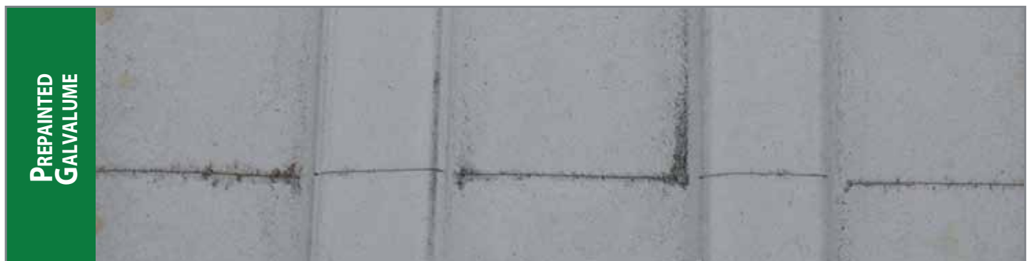
Comparison of corrosion on a scratch site on 20 year old building in Ontario, Canada.